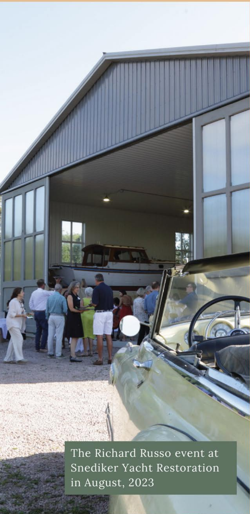
The Richard Russo event at Snediker Yacht Restoration in August, 2023